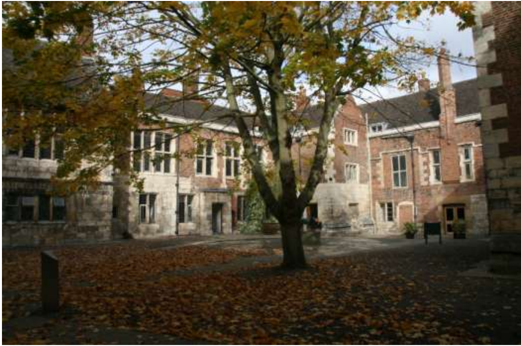
The King's Manor

Cost: £300, which includes instruction and provision of all basic tools and materials.